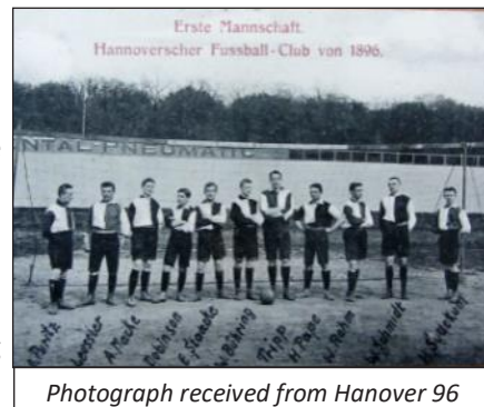
Photograph received from Hanover 96